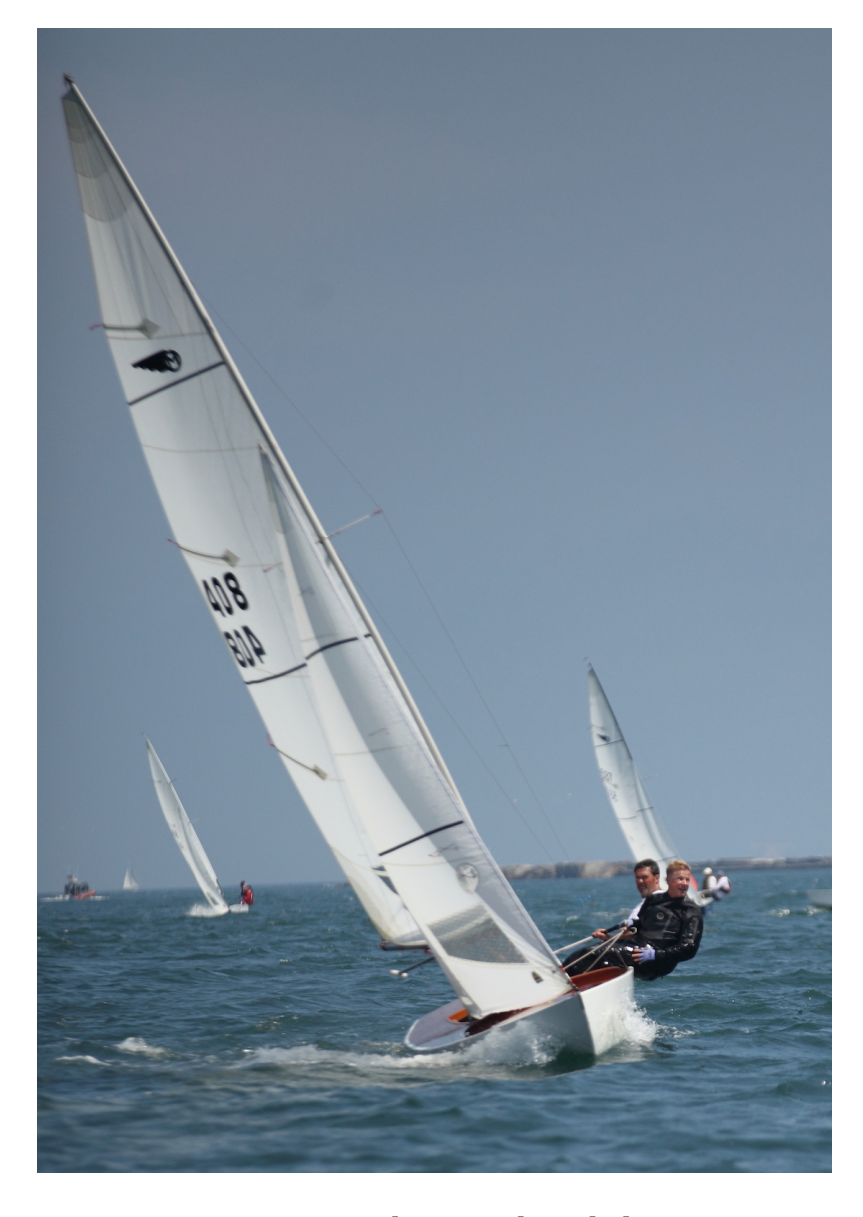
Los Angeles Yacht Club 2018 National Championship Regatta