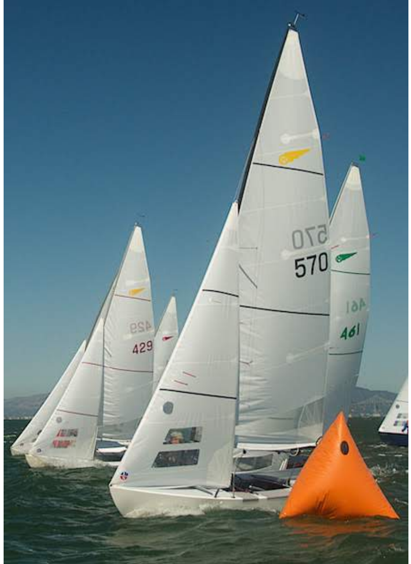
Richmond Yacht Club 2019 National Championship Regatta